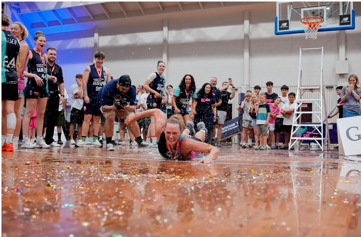
Tauranga Whai celebrate beating the Tokomanawa Queens 90-71 in the final.