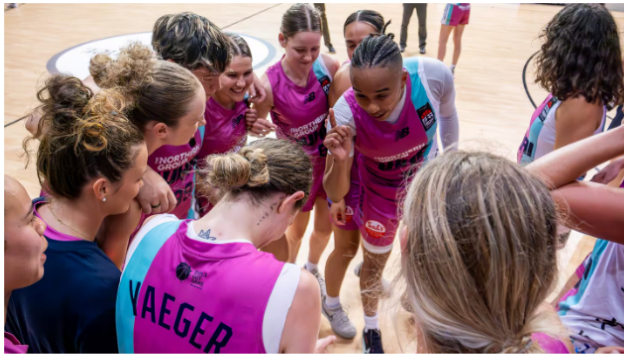
The Tauranga Whai after beating the Northern Kāhu, taking them to their first-ever final in franchise history.

Tauranga women's basketball team the Whai have made history by reaching their first grand final since joining the national professional Taihi League three years ago.