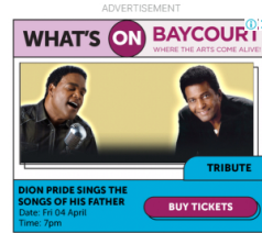
Advertise with NZME