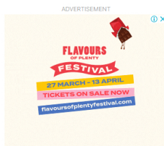
Advertise with NZME