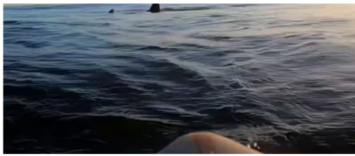
Two surfers encountered a pod of orcas off Arataki Beach on Sunday morning.