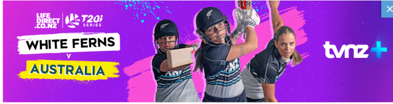
Advertise with NZME