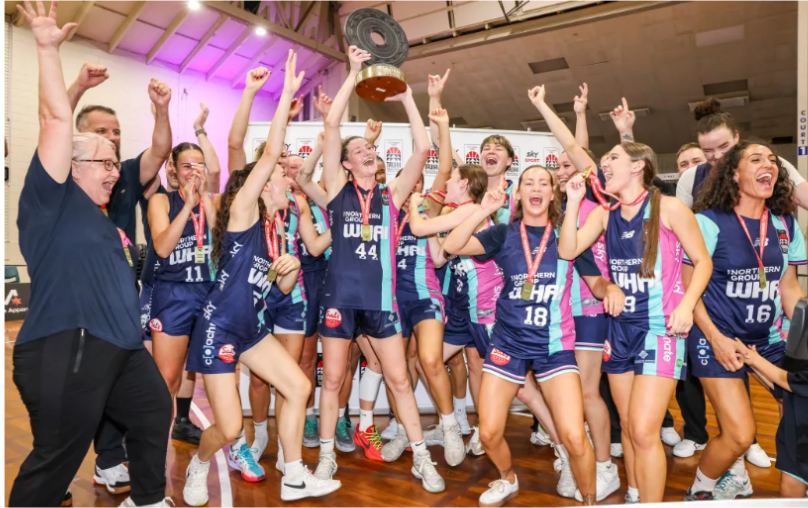
Tauranga Whai players celebrate their Taiuhi Basketball Aotearoa final win over the Tokomanawa Queens in Tauranga, 22 Dec 2024.

Tauranga Whai have proved stormed to their first Taiuhi national women's basketball crown with an emphatic 90-71 win over Wellington's Tokomanawa Queens in Tauranga.