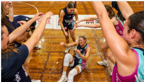
Whai players celebrate after winning the 2024 Tauhi basketball final.