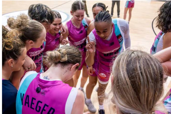
The Tauranga Whai after beating the Northern Kāhu, taking them to their first-ever final in franchise history.