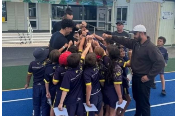
'Whai in the Community' is a programme that aims to connect individuals and communities across Tauranga and wider Bay of Plenty.